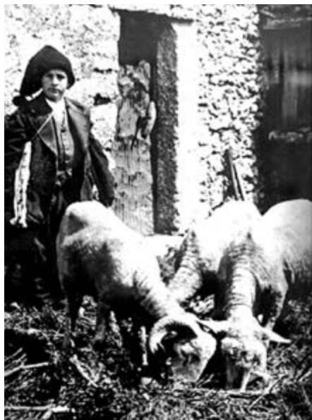
The little shepherd, Bl. Francisco