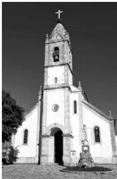
The chapel where Francisco, Jacinta and Lucia were baptized