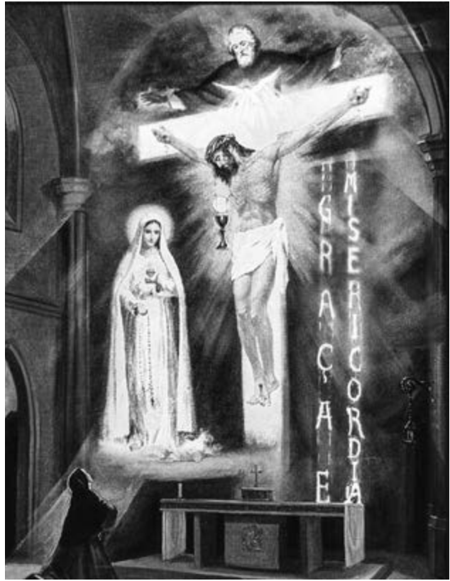
The vision on June 13, 1929 in Tuy

‘The moment has come when God asks the Holy Father to make, in union with all the bishops of the world, the consecration of Russia to my Immaculate Heart, promising to save it by this means. So numerous are the souls which the justice of God condemns for sins committed against me, that I come to ask for reparation. Sacrifice yourself for this intention and pray.’