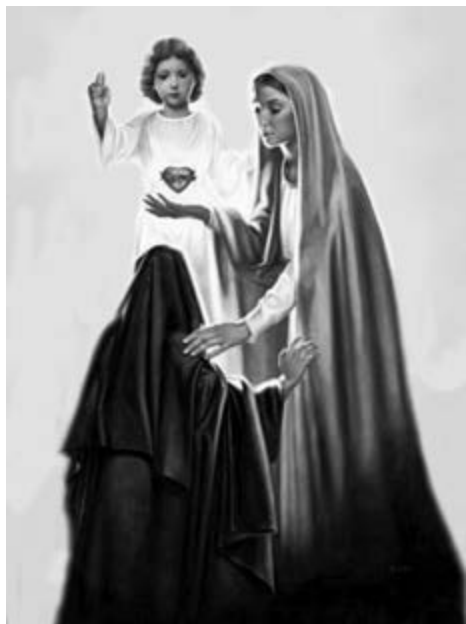
The apparition in Pontevedra on December 10, 1925

embraces this devotion, I promise salvation!" Before reading what follows, we should return to the message of Our Lady on that day and meditate on the amazing promises she gave then (see book one, chapter 10, pages 87 to 91). More than eight years after that day the time had come to unfold in a very concrete and detailed manner the practice of the devotion to the Immaculate Heart of Mary, which happened in two steps: firstly, the message, given by our Lady herself together with the Child Jesus in Pontevedra on the tenth of December 1925, explaining the practice of this devotion; secondly, the motives behind these practices together with some concrete details concerning certain aspects of this devotion. These details pertain to an apparition of the Child Jesus at the same place on February 15, 1926 and the revelation of Our Lord on May 29, 1930 in Tuy.