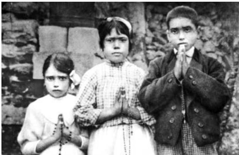
Children of Fatima: Jacinta, Lucy, Francisco

Let us conclude that Jacinta's many little prayers were so pleasing to Our Lady that not only did Our Lady fulfill the wishes of her little seer, but she transformed Jacinta into a great saint. Certainly Jacinta prayed much more for others than for herself in her short life. Our Lady's reward should always remind us of the old rule: what you do for others, you do twice for yourself!