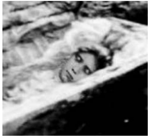
The incorrupt body of Blessed Jacinta Marto during exhumation in 1935 and 1951