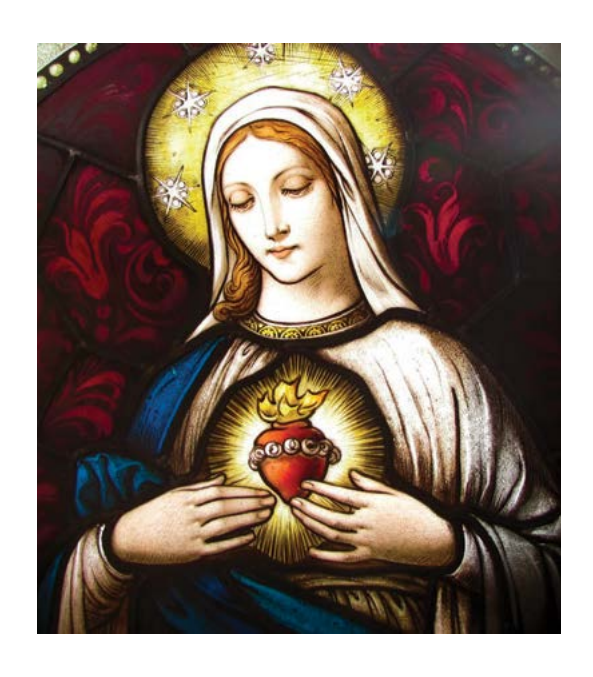
"In the end, My Immaculate Heart will triumph".

The words concluding the whole secret of Fatima are the most consoling words Our Lady has ever spoken: